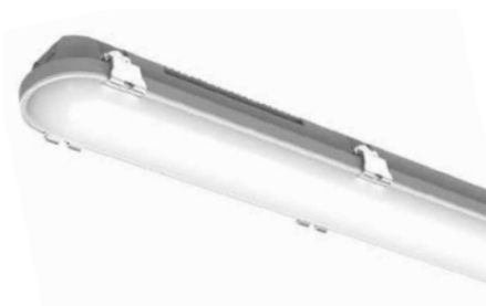
ECO FIX ES FLECHA 2X5/ST/E